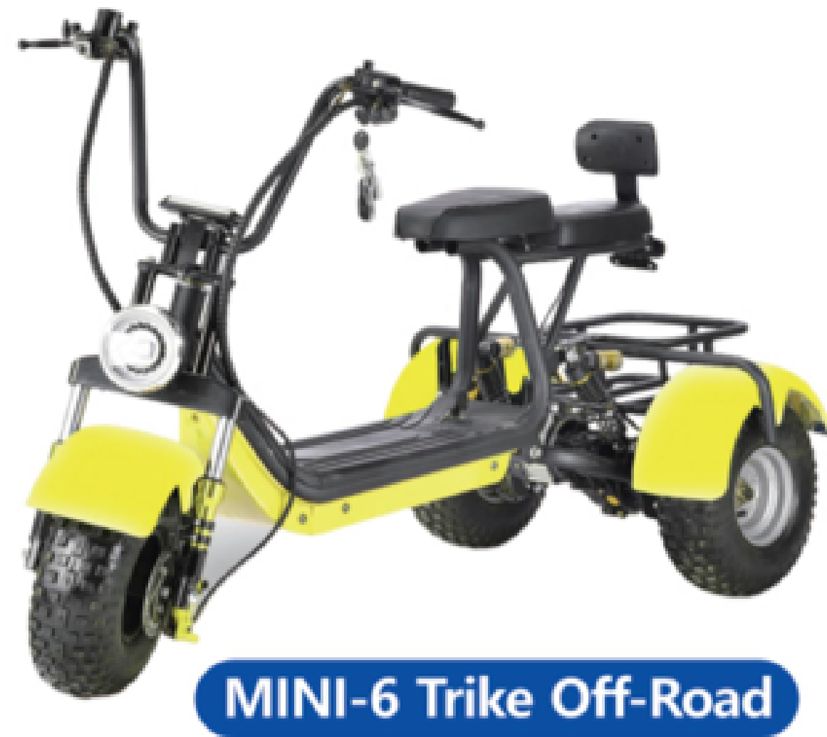
MINI-6 Trike Off-Road