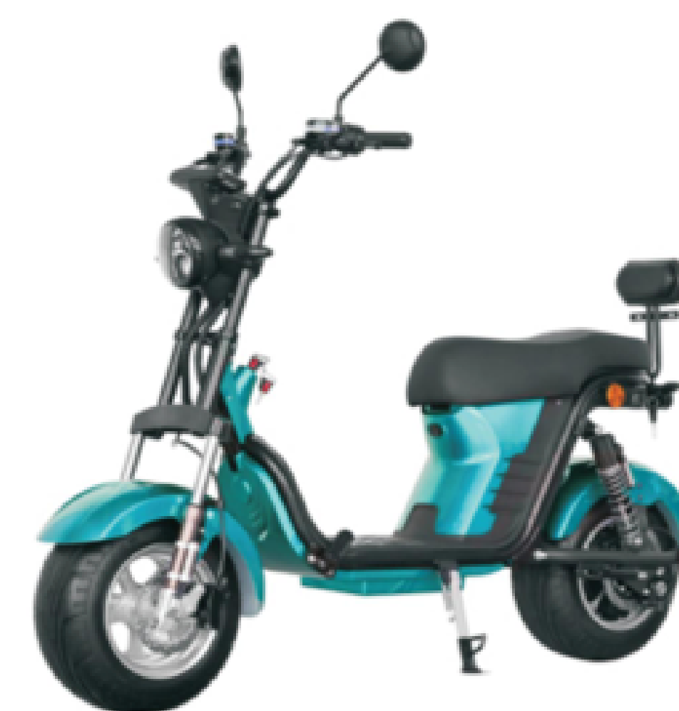
Third Generation PLUS

SIZE 1500*630*920mm PACHKING DIMENSIONS 1250*400*750mm Frame material iron SPEED(km/h) Speed limit 32, lift 55-60 SHOCK 减震 Dual shock absorption RATED VOLTAGE (V) 60V CAPACITY (mAh) 12AH 20AH Range (km) 25-30km 40-45km SMART BMS Balance Charge / Charge Protect / Low Voltage Protect / High Temperature Protect RATED POWER (W) 1000w (Actual 2.0kw marked 1.0kw) GRADIENT ≤40° CERTIFICATE CE, ROHS Charging time About 4-6 hours INPUT VOLTAGE (V) 100 ~ 240v OUTPUT VOLTAGE (V) 67.2V RATED CURRENT (A) 2A CERTIFICATE CE, UL, SAA FRONT TIRE 10inch Vacuum Tire REAR TIRE 10inch Vacuum Tire BRAKE: (Front$rear) Hydraulic Disc Brake N.W 55kg