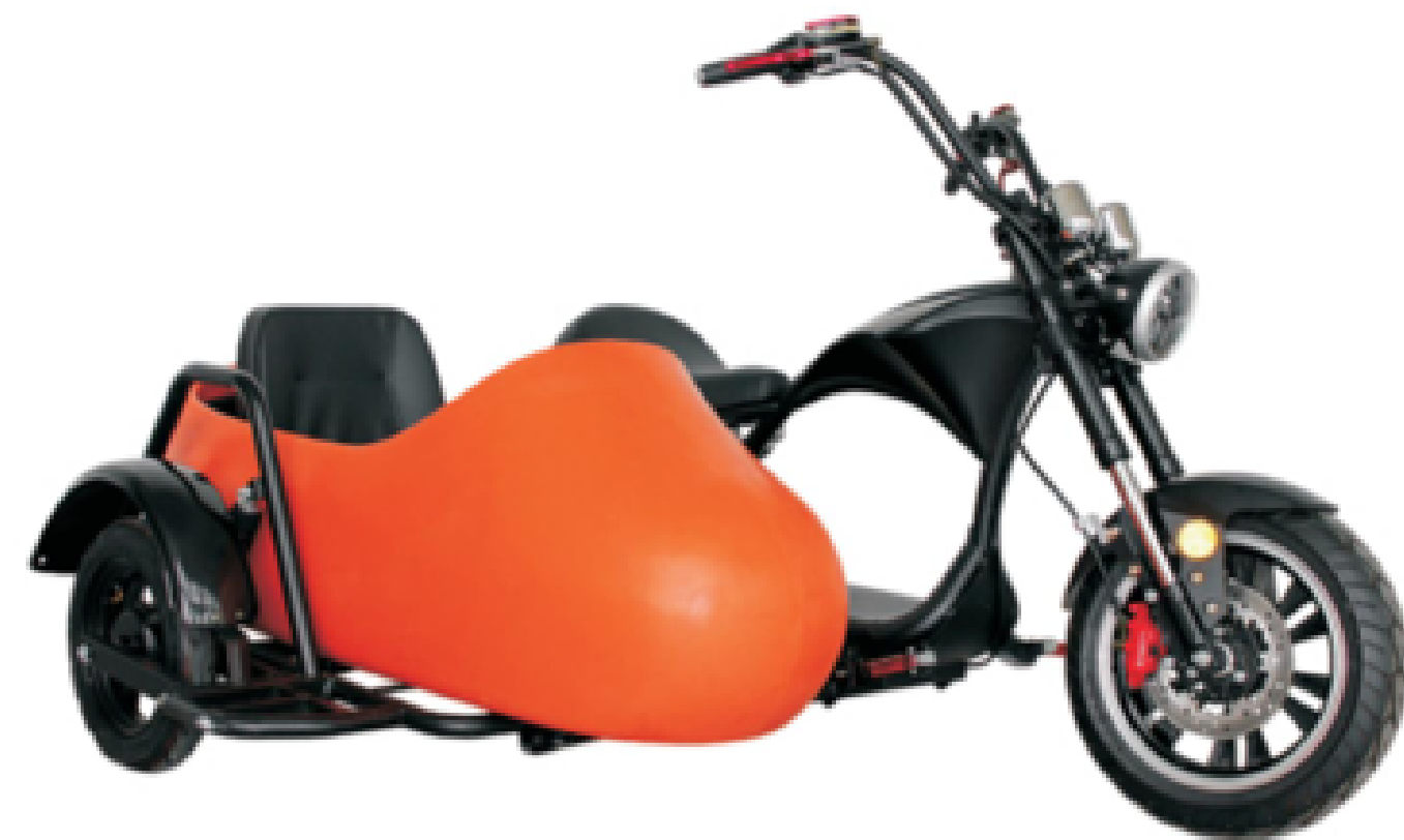
CP4 side tricycle