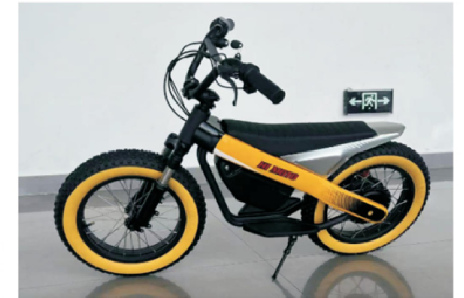
16 inch high-speed model