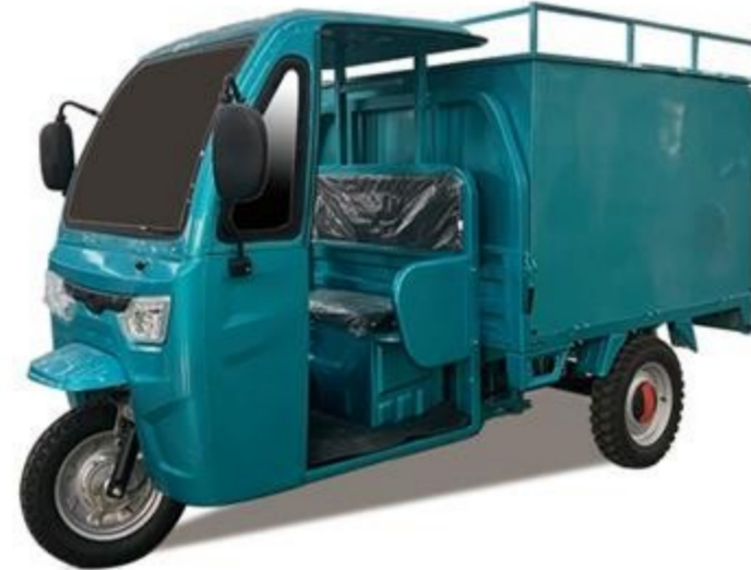
B01 Express vehicle

■ Vehicle Dimensions: 2955*1120*1350mm ■ 40HQ Loading quantity : CKD65/SKD50 ■ Motor : 1000WD ■ Braking System : Drum brake ■ Max Speed : 38KM/H ■ Tire size : F:3.75-12 R:4.00-12 ■ Battery : LAB60V80AH ■ Max range : 110KM